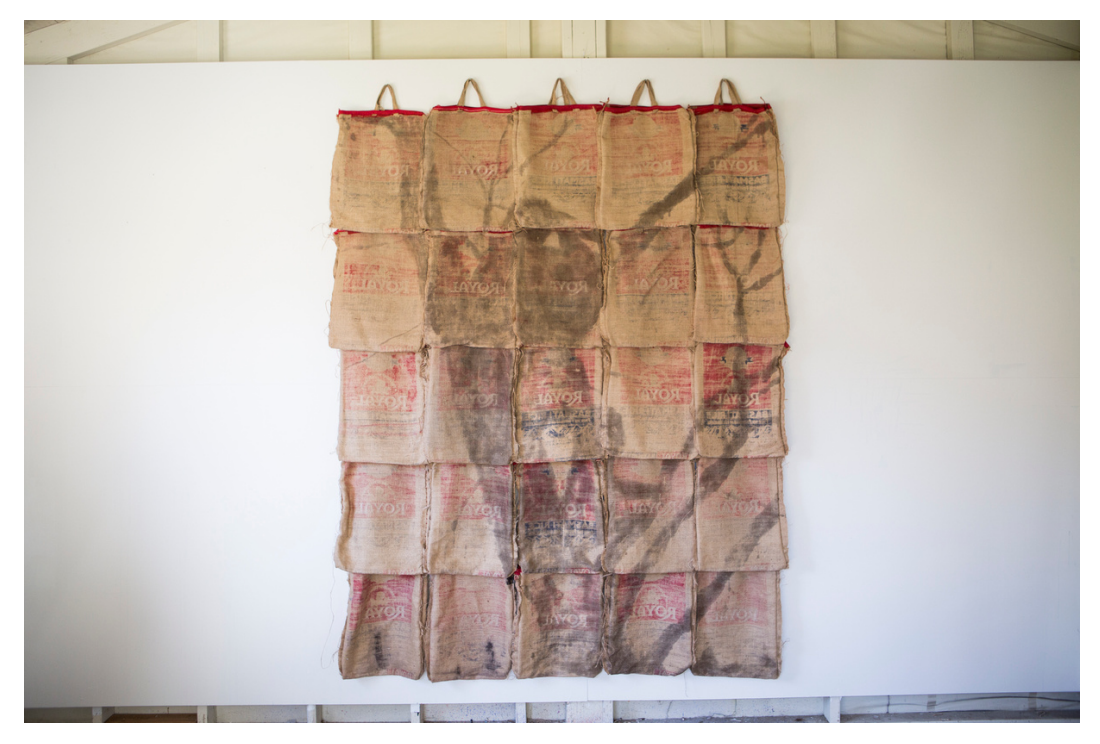
'Raj in the Tree' by Sanjay Vora. (Courtesy of the artist.)

"It's an interesting deviation from 'Where are you from?' or, 'Where are you really from?'" says Ehrhardt, pointing out that that's the question typically associated with Asian-Americanness. "The question of, 'Excuse me, can I see your ID?' takes on this other meaning that's not just identity, place, home, belonging. It suddenly can turn into something like: How does this state view you? How does this state categorize you? Are you documented? Are you undocumented?"